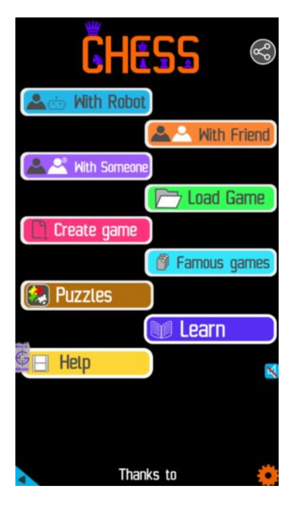
Figure 2: Play chess online for free. Solve puzzles and play with friends

Play chess for free at https://gbud.in/chs